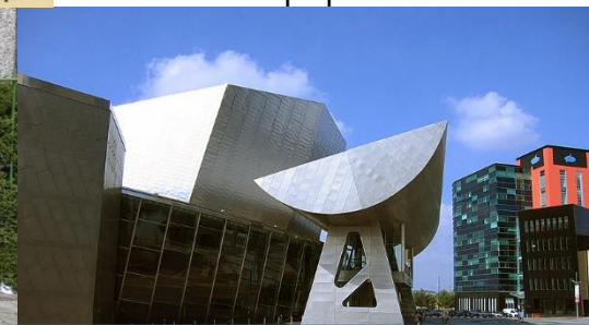
The Lowry Gallery, Salford Quays

There is also a memorial statue of Lowry sketching in a park in Mottram, where he lived for 25 years.