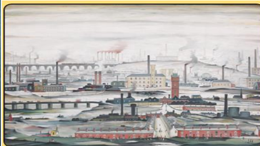
Industrial Landscape, 1955 by LS Lowry

Lowry painted lots of industrial landscapes , as this was what he saw around him as he went about his daily life.