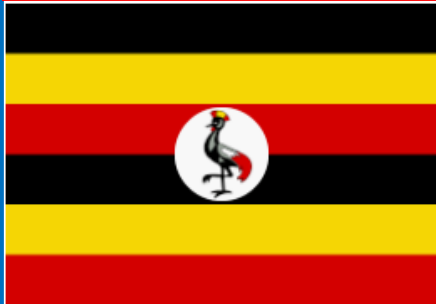
This is the Ugandan flag.

Recap - The country I live in is called England. My school is in New Mills, which is a small town in Derbyshire. England is a country in the United Kingdom. It is made of four countries England, Scotland, Wales and Northern Ireland.