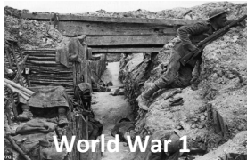
World War 1