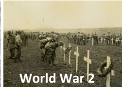
World War 2

Pictures can help us to see what life was like in the past. Have a look at these pictures. How do they make you feel?