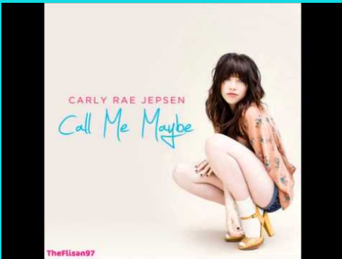
Call me maybe by Carly Rae Jepsen

Listen to these different styles of music.