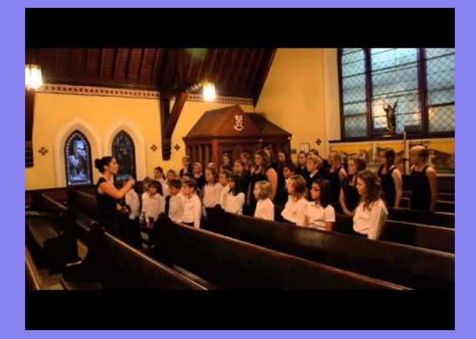
Dona Nobis Pacem Chorus Niagara Children's Choir