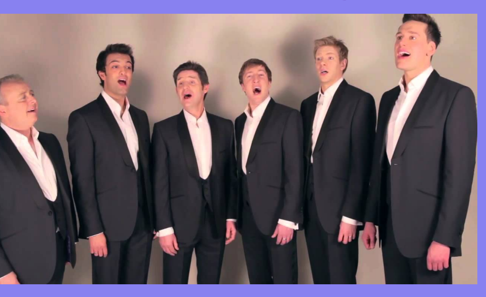
Now Is the Month Of Maying The King Singers

Ain't Gonna Let Nobody' The Freedom Singers