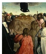
The Ascension by Juan de Flandes